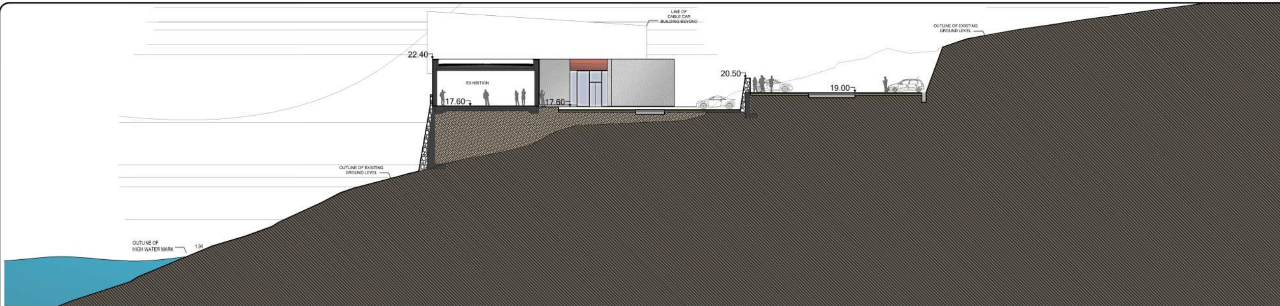
D:D (EXHIBITION/SHOP) SCALE 1:200